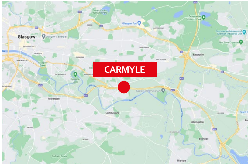
Carmyle area location plan

The nearby M74 motorway provides links both east and west to the M73, M77 and M8 motorways.